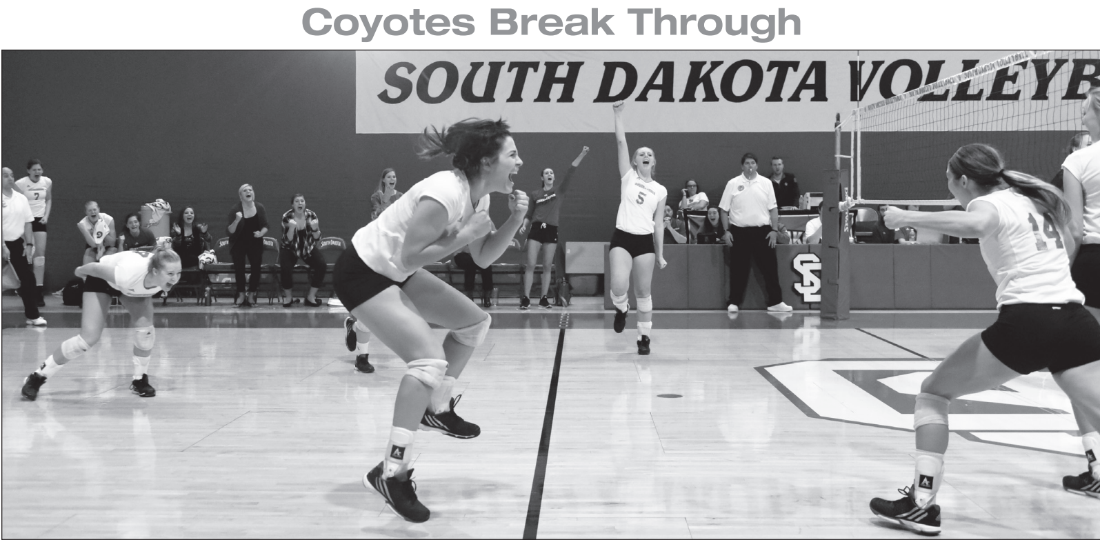
South Dakota players celebrate a point during the Coyotes' 3-2 victory over Oral Roberts in Summit League volleyball action on Sunday at the Coyote Den in Vermillion. It was the Coyotes' first Summit League victory of the season.