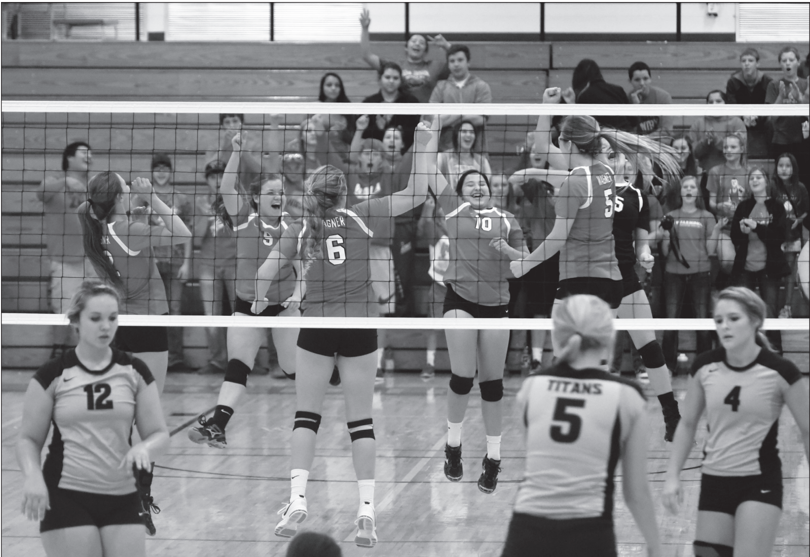
Wagner players and fans celebrate after the Red Raiders won the first set of their prep volleyball match against Mount Vernon-Plankinton on Monday in Wagner. The Red Raiders won 3-0, handing the Titans their first loss of the season.