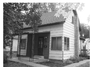
404 N. Birch Avon $45,000

Great acreage for an affordable price. 6-acres, 50x100 steel building. This delightful, sun-plashed home offers quiet peaceful living. Rick, Anderson Realty, (605) 760-9976.