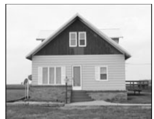
29261 415th Ave, Scotland $150,000