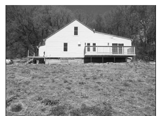
902 Beemer • $121,500

7-bedroom, 2-car garage, & large detached garage. This nearly 4,000 sq.ft. home is conveniently located near West Side Park, the hospital, YHS, Lincoln Elementary. Call Rick, Anderson Realty 605-760-9976.