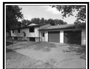
148 Dayton Lane (Deep Woods) Price Reduced $248,500

Classifieds Work! Submit an ad online at www.yankton.net