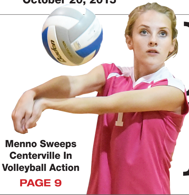
Menno Sweeps Centerville In Volleyball Action PAGE 9