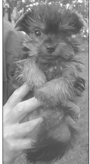
AKC tiny Yorkie, boy pup, in home, will be small, pet only, $375. (605)449-4330.

1555 Dogs - Puppies AKC Registered Labs, 8 weeks old. $250/each. Call (518)813-8810.