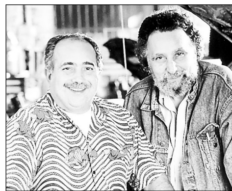
CLICK & CLACK

Dear Tom and Ray: My wife went to a quickie oil-change place, and they told her that her radiator cap needed to be replaced because it wasn't holding pressure anymore. She called me and asked if she should let them replace it. I asked how much, and they quoted $15. I said no, and that I would take care of it. I went to the auto-parts store and replaced it for $4. The next time she needed an oil change, they told her the same thing, and she agreed to it and spent the $15. Needless to say, I was annoyed; her radiator cap was only three months old. Then I went to the same place with my car, and watched them change my oil. They took my radiator cap, and stuck what looked like the ball tap to a mini keg on it. They pumped the thing a few times, and told me that my radiator cap was not holding pressure and that I needed a new one. I said I would take care of it, but I am convinced that this pressure check was a scam. Was this a true test, or just a way to add $15 to a customer's bill?