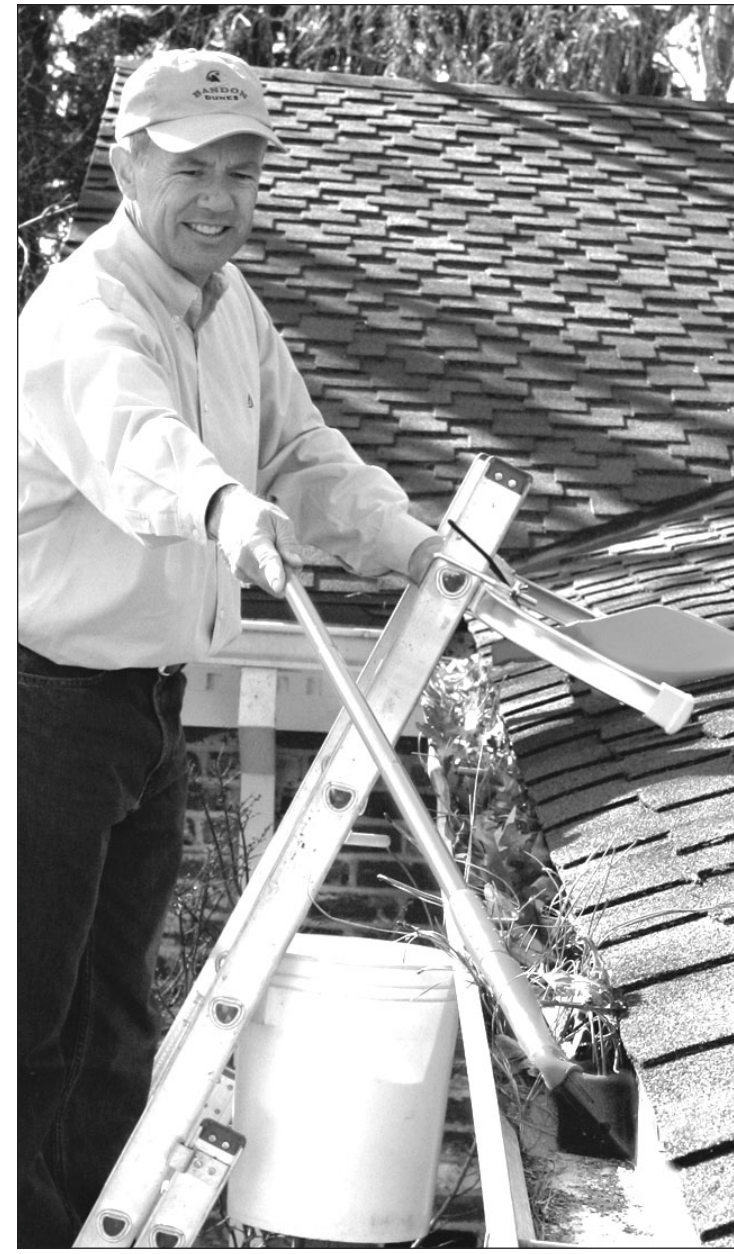
Using the right tools makes gutter cleaning faster and easier.

Whether your plans are for a basement pantry, woodshop, laundry room or even a living room or play room, you have to start with a dry space and the best start is with a reliable, reputable waterproofing paint. Simple step by step instructions on waterproofing your basement can be found at www.ugl.com .