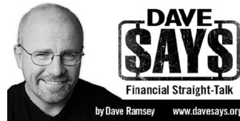
by Dave Ramsay www.davesays.org

Here's what I want you to do. First, apply for every college scholarship you can find. Next, get a job! You may even have to take a couple of part-time jobs, but so what? Once you're there, live in the dorm and eat dorm food, too. It won't kill you. And a state college, where you can get in-state tuition, is always a good idea. If there's one close by you can save