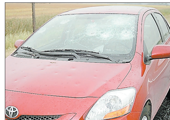
A motorist was forced to abandon his car on Highway 50 approximately two miles west of Vermillion late Wednesday morning after the area was pounded by hail and rain.

Two major conditions mixed to create the variety of storm activities, Laflin said. "Really, the storm was created by a warm front that pushed north out of Nebraska," she said.