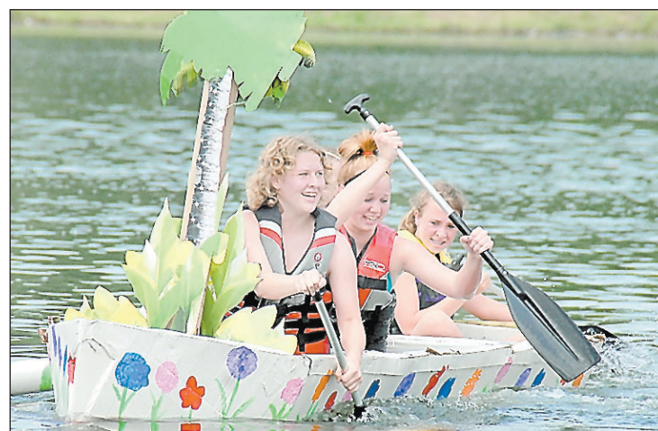
ABOVE: These entrants in the Cardboard Boat Races in June make headway on the waters of Lake Yankton. (Hoeck) RIGHT: Sleep wasn't really on the minds of these young performers from Judi's Dance Studio in Yankton; they were performing a dance number during Riverboat Days in August. (Hertz)