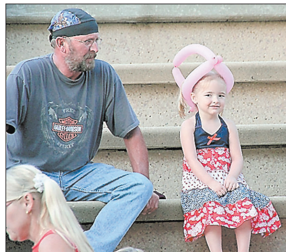
The Girls of Summer... ABOVE: This girl is dressed in holiday attire from head to toe and she takes in the Fourth of July program at Yankton's Riverside Park. BELOW: This girl shows similarly appropriate attire during the Czech Days parade in Tabor in June.