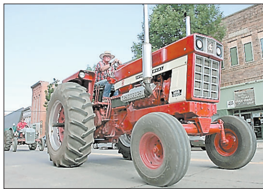
Some staples of a Yankton summer... ABOVE: The Old Iron Tractor Ride brought a parade of farm machinery to the streets in July. RIGHT: A dog show was part of the Yankton County 4-H Achievement Days in August.