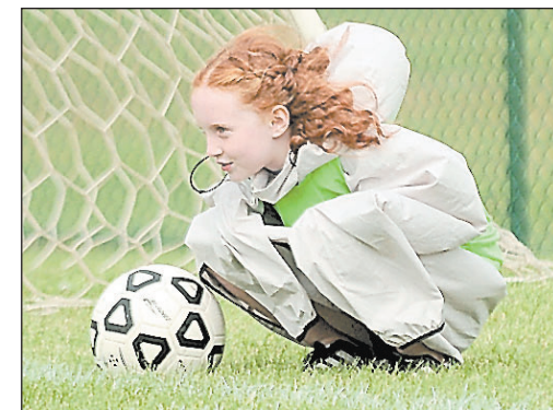
A ball girl tries to stay warm during the second half of the women's soccer match between South Dakota and Western Illinois, held at the USD Soccer Field in September. (Cimburek)