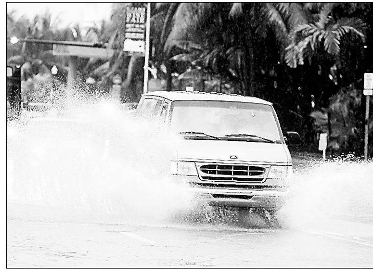
Cars move through the flooded roads caused by Tropical Storm Nicole in Miami Beach, Florida, Wednesday.