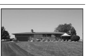
43408 Kaiser Road $214,900

2-bedroom, 2-bath, lake property. Deck, fireplace, gazebo, guest house. $285,000. Charlii, America's Best Realty. (605)660-2752.