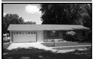
1012 E. 15th * $117,500