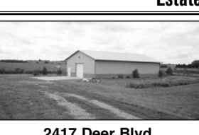
2417 Deer Blvd

$139,000. Huge 2200sq.ft building, high door, on approximately 7.96 acres. Also for rent $650 per month. Lisa Noecker, Anderson Realty LLC (605)661-0054.