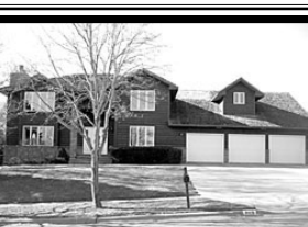
905 W 13th $379,000

This is better than the house you dreamed about with over 4,000 sq ft finished! Great floor plan. Spacious master suite with sitting area & closets galore. Huge 3 car garage on a nicely manicured lot. Lisa, Anderson Realty, LLC (605)661-0054