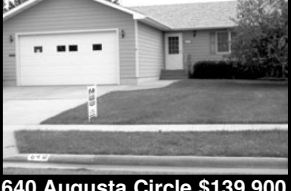
640 Augusta Circle $139,900

New twin home. Quality built, no step design. Beautiful hardwood. 2-bedroom, 2-bath, laundry on main. HOA. List Construction (605)661-8003.