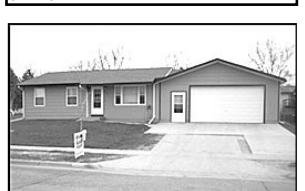
2400 Cedar Terrace $129,000

Awesome location, 3-bedrooms on main, 2-bath, full basement, oversized garage. New shingles, (seller to install new shingles buyers choice) Lisa, Anderson realty, LLC (605)661-0054.