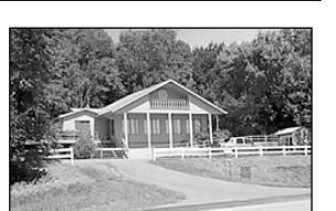
43384 SD Hwy. 52

4-Bedroom House, 2-Full baths, wood floor, available Oct. 1st, (605)661-8405