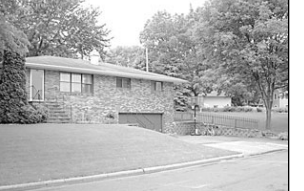
905 Karen Dr.