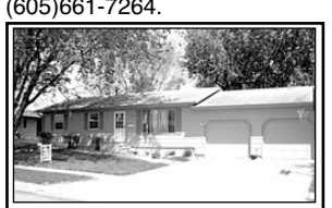
206 Golf Lane * $115,000

2-bedroom, 1.75 bath, 1000 sq. ft. Garage. Not a drive by. Joe, Americas Best Realty. (605)661-7264.