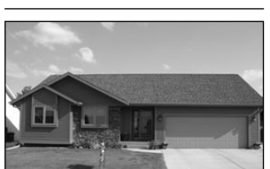
1214 Peyton Lane, Yankton $249,000

2-bedroom, 2-bath, beautiful, totally renovated. Nice area, close to everything! $141,900. Charlii, America's Best Realty. (605)660-2752.