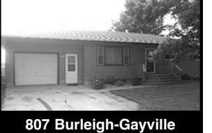
807 Burleigh-Gayville $89,900