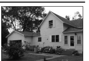
31371 453rd Ave. Gayville $169,900