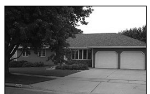
2704 Pine * $199,900

3-bedroom on main. Oversized heated/cooled garage/workshop. Ted Mickelson, Anderson Realty. (605)661-1640.