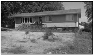
210 9th St. Springfield $94,900