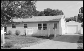
1104 E 15th • $111,700

Wonderful 2-story, 4-bedroom home, 2 car garage, workshop, all on 3 city lots. Ted Mickelson, Anderson Realty, LLC. (605)661-1640.