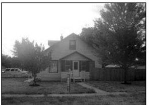
701 Mulberry $79,900