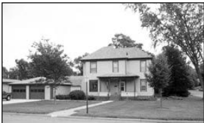
1100 Walnut REDUCED

Wonderful 2-story, 4-bedroom home, 2 car garage, workshop, all on 3 city lots. Ted Mickelson, Anderson Realty, LLC. (605)661-1640.