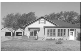
44460 302nd Volin $187,900

2-bedroom, 1-3/4 bath brick house with AC. Finished basement, 2-car garage, corner lot with lawn sprinklers. (913)680-9934. www.yankton.net/415pearl/