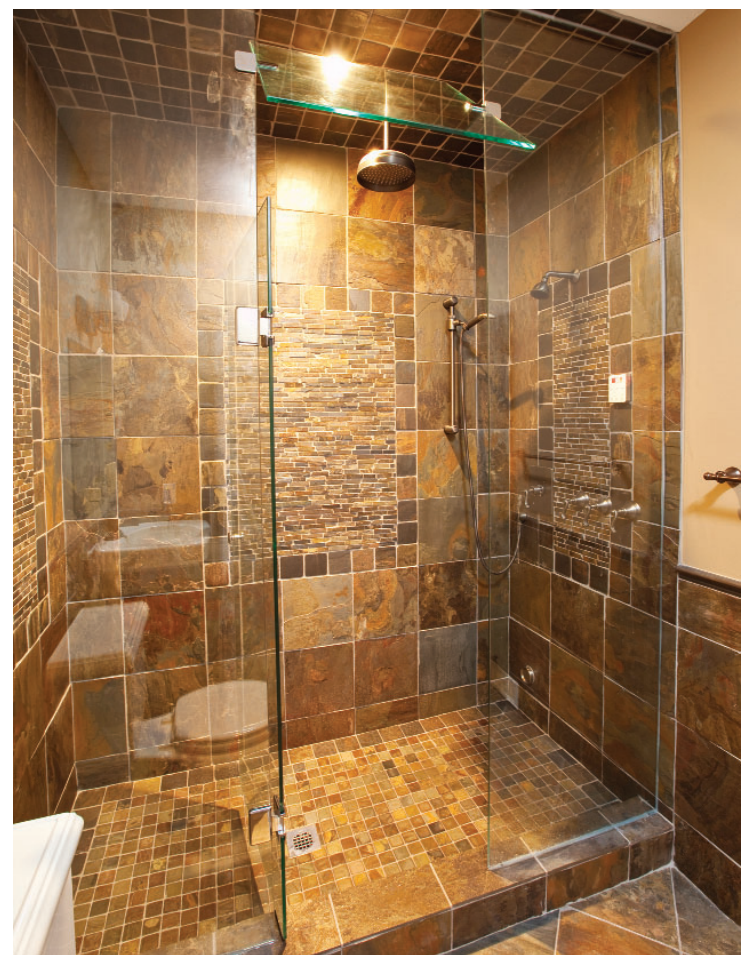
A frameless shower can take up less space in a small bathroom.