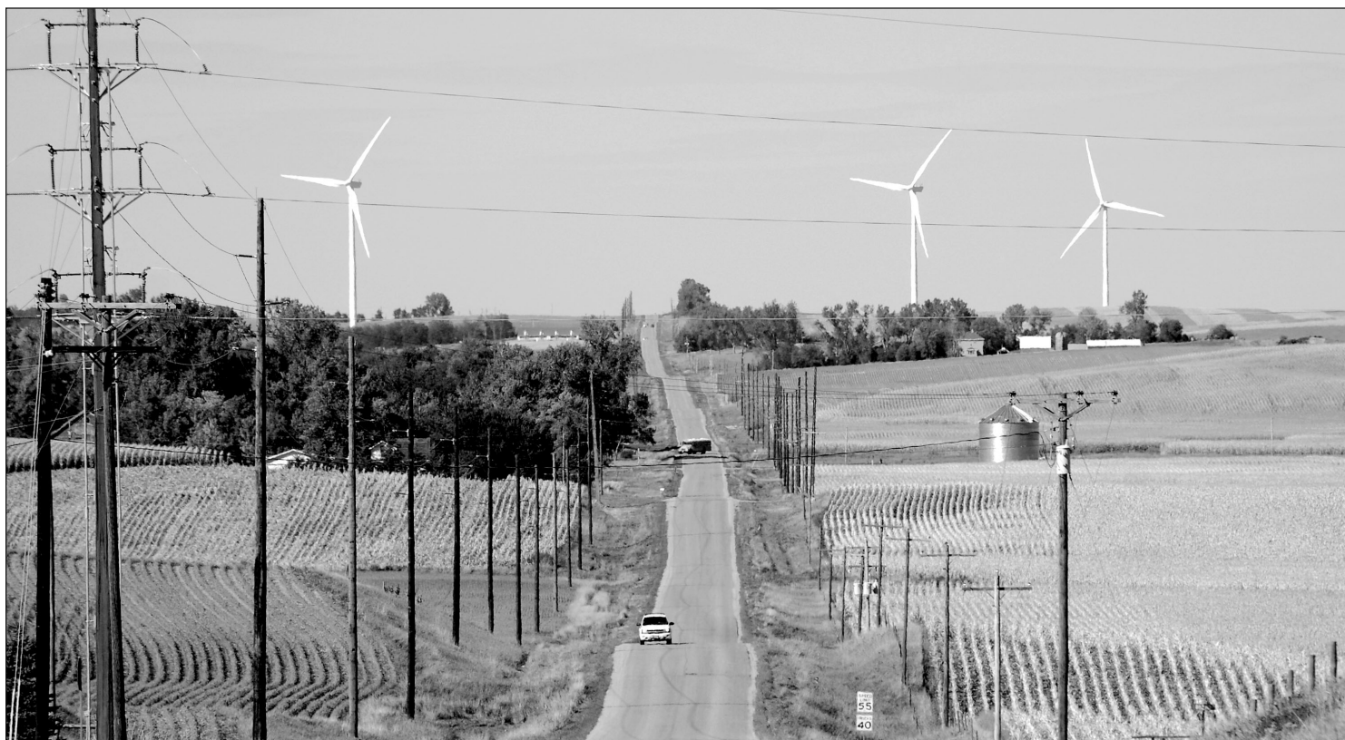
Traffic rolls pass wind turbines dotting the countryside near Bloomfield, Neb. The Elkhorn Ridge turbines, a familiar sight for travelers, are gaining neighbors as construction crews install more turbines for another wind project near Crofton, Neb., in Knox County, Neb.