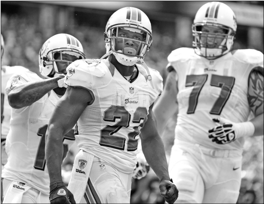
Reggie Bush of Miami celebrates his first touchdown in the third quarter. The Miami Dolphins defeated the Oakland Raiders, 35-13, at Sun Life Stadium in Miami Gardens, Fla., on Sunday, Sept. 16.

Bush is also supremely talented, and the Dolphins' new coaching staff is eager