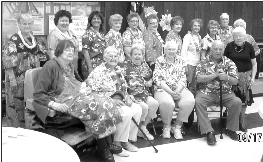
Members of The Center pose for a group photo on Hawaiian Day, held this past week as part of Senior Week.

For more information on Mount Marty College's volleyball program, visit www.mmclancers.com .