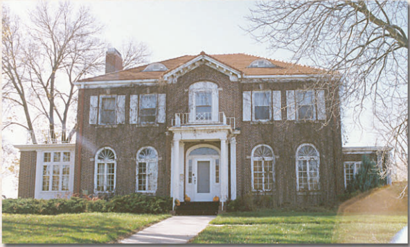
Kabeiseman-Nelson Funeral Home

business took on several different names throughout the years as several partners joined/left the firm. In 1963, the Tabor and Yankton businesses combined operations and in 1977 the firm officially became known as the the Kostel Funeral Home. Around this time Kostel Funeral Home also began doing the professional work for the operations of the Aisenbery Funeral Home in Menno, which they later purchased. 1978 – Kostel Funeral Home in Yankton moved into the current structure.