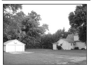
200 Kingsbury St. • Gayville Priced to Move $45,000

Very well kept 3-bedroom, 2-full bath mobile home. $150/month lot rent, affordable living at it's best! Jolene Green, Century 21 (605)464-9634.