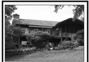
137 Sleepy Hollow Dr. $540,000

10.73 majestic acres. Lake view home, Carla, Century 21 (605)661-8643.