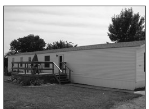
1402 Meadow View Road $24,000

10.73 majestic acres. Lake view home, Carla, Century 21 (605)661-8643.