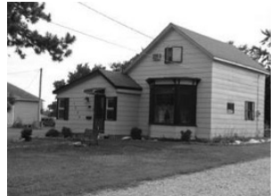
1208 Main St Tyndall Price Reduced $85,000

Lake home, wrap around deck, lake view. 3-Bedroom, 1-1/2 bath, 4-stall garage. Max Payne, Anderson Realty, LLC (605)661-8434.