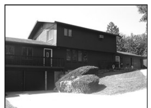
117 Gavins Place $229,000

Move in ready, 2-bedroom ranch with new ceramic tile in bathroom and kitchen. Granite countertops, newer plumbing and new furnace. (605)660-0618 Bill Conkling, Lewis & Clark Realty.