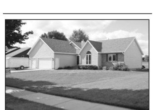
2605 Mulligan Drive $257,500

4-Bedroom, 2-full bath, 1881 square feet, 2+ car garage. (605)660-7537 www.yankton.net/app/html/204brown/