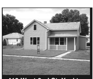
418 West 2nd St. Yankton $99,900