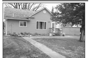
108 W. 22nd • Tyndall $54,900

Move in ready, 2-bedroom ranch with new ceramic tile in bathroom and kitchen. Granite countertops, newer plumbing and new furnace. (605)660-0618 Bill Conkling, Lewis & Clark Realty.