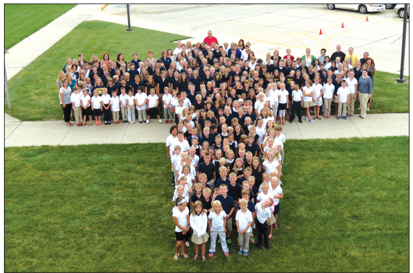
Students and staff from both Sacred Heart Elementary School and Sacred Heart Middle School gathered for a group photo following the All School Back to School Mass on Sept. 4, 2013.