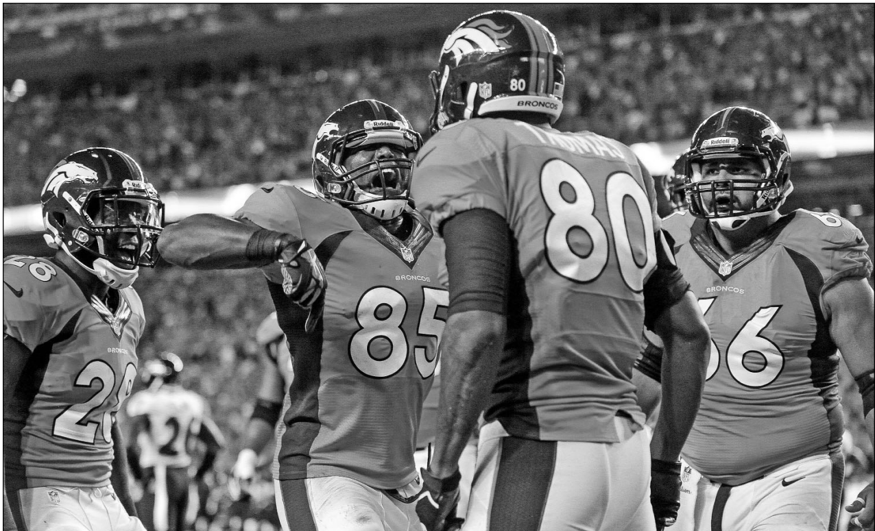
Denver Broncos tight end Virgil Green (85) celebrates with tight end Julius Thomas (80) after Thomas' 24-yard TD catch in the second quarter against the Baltimore Ravens on Thursday at Sports Authority Field at Mile High in Denver, Colo.

What's that you say? It's just a game. There's no balance in our lives. We should spend more time worrying about a potential war in Syria than we do about Rex Ryan's latest gaffe.