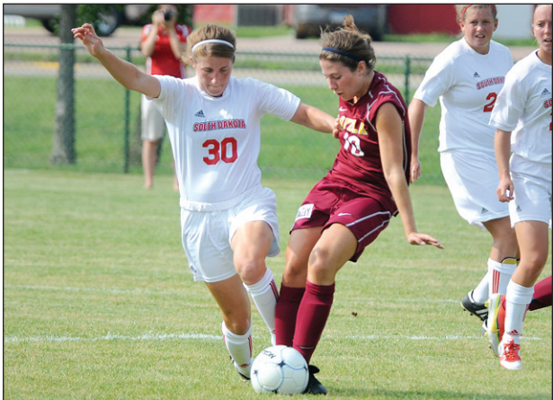
USD Soccer Seeing A Season Of Progress • 7