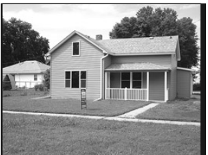
418 West 2nd St. Yankton $99,900