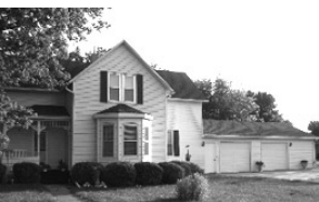
204 Brown St., Gayville For Sale by Owner $137,000

4-Bedroom, 2-full bath, 1881 square feet, 2+ car garage. (605)660-7537 www.yankton.net/app/html/204brown/