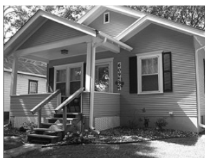
609 Green $105,000

Gorgeous 5-bedroom home, original woodwork/hardwood floors, updated bathrooms/ kitchen. Huge covered front porch. Ginny, Discovery Realty, LLC, (605)661-6031.