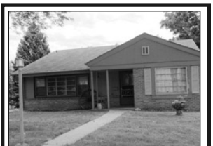
309 E. 9th Reduced * $114,900