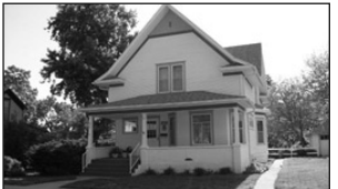
606 Capital • $131,900

Magnificent 5-bedroom 6-bath home with 4-fireplaces and gorgeous upscale kitchen! Ginny, Discovery Realty, LLC (605)661-6031.