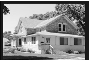
417 Locust $122,500

3-bedroom, 1-1/2 bath, brick home. Large rooms, corner lot. Emma, Century 21 (605)661-2224.