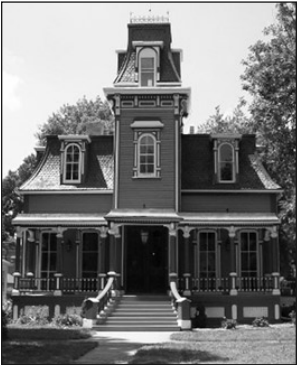
517 Mulberry • $285,000

Cheaper than rent! Remodeled 4-bedroom home with several updates, new kitchen/bath, double stall garage. A must see! Call Kami Guthmiller (605)660-2147 Lewis and Clark Realty.