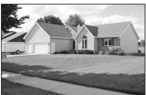
2605 Mulligan Drive Reduced * $249,500

4-bedroom, 4-bath, view of Lewis & Clark Lake. Gardeners delight with 2-acres of landscaping. View more yankton.net/app/html/236drees (605)857-1977 keith.halvorson@gmail.com