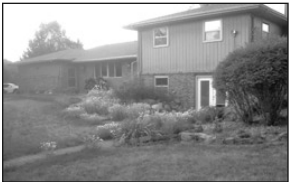
236 Drees Drive $349,900

4-Bedroom, 2-full bath, 1881 square feet, 2+ car garage. (605)660-7537 www.yankton.net/app/html/204brown/