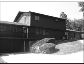
117 Gavins Place $229,000

Move in ready, 2-bedroom ranch with new ceramic tile in bathroom and kitchen. Granite countertops, newer plumbing and new furnace. (605)660-0618 Bill Conkling, Lewis & Clark Realty.