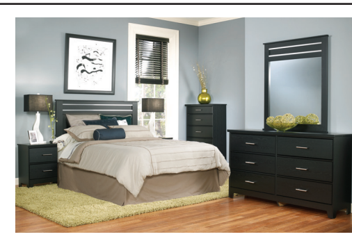
Queen Headboard, Dresser, Mirror & Nightstand