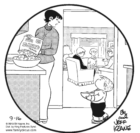
"No, I don't think anybody is interested in how many potato chips you can put in your mouth."