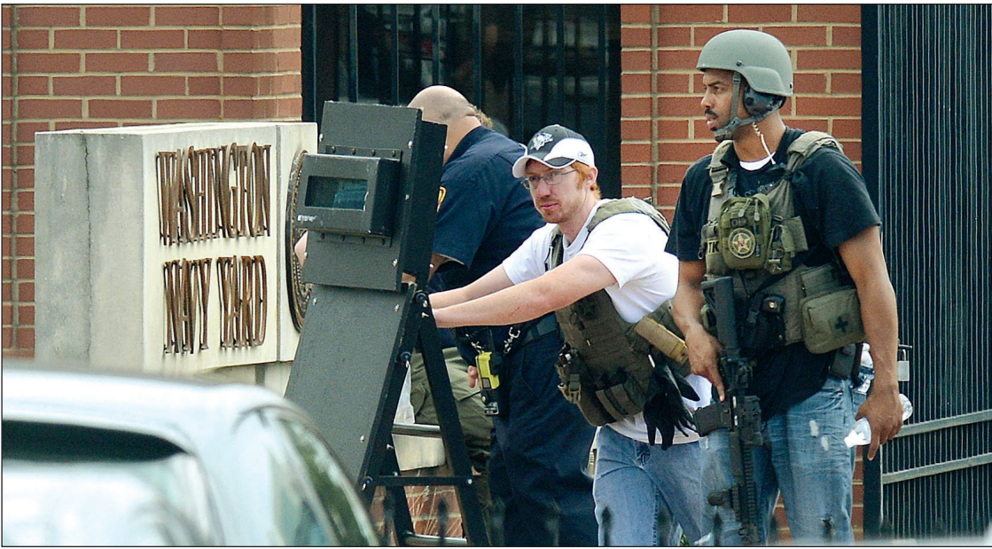
Law enforcement personnel respond to an attack on office workers at Washington Navy Yard Monday morning. A gunman opened fire and killed 13 people in the attack in Washington, D.C.