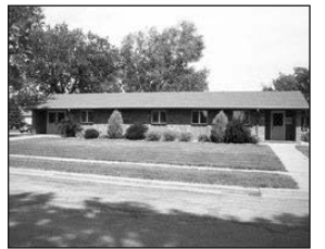
812 Belfast Commercial Building

Main level 1800 sq.ft., full basement, brick exterior. Interior new paint, 6-9x10 office spaces. Waiting room & reception area. Max Payne, Anderson Realty (605)661-8434.