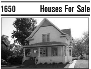
606 Capital • $131,900

When you finish reading, Please RECYCLE.