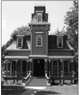
517 Mulberry • $275,000