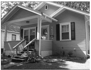
609 Green * Yankton $105,000

Gorgeous 5-bedroom home, original woodwork/hardwood floors, updated bathrooms/kitchen. Huge covered front porch. Ginny, Discovery Realty, LLC, (605)661-6031.