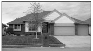
2707 Lakeview * $375,000

Lake home, wrap around deck, lake view. 3-Bedroom, 1-1/2 bath, 4-stall garage. Max Payne, Anderson Realty, LLC (605)661-8434.