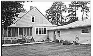
30358 448th Ave., Volin $172,500