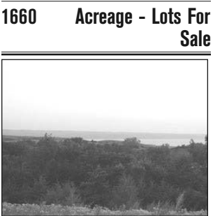
5 Acres 301St • Colony Rd • Tabor $77,500

1655 Mobile Homes For Sale 3-bedroom, 2-bath mobile home for sale, lot included, fixer upper, new roof. $7,000/OBO. Call (605)212-3677.