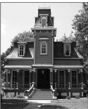
517 Mulberry • $275,000