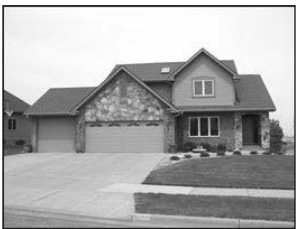
1300 W. 17th St. $329,000

1-1/2-story, 5-bedrooms, 3-1/2 baths, 3-car garage, corner lot in Summit Heights. Available October 1st. (605)661-1799 for viewing or more information http://www.yankton.net/app/html/1300w17th/