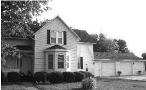
204 Brown St., Gayville For Sale by Owner $137,000