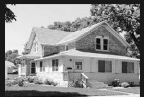
417 Locust $122,500

1,800 sq.ft. finished ranch, completely remodeled 2006. 40x26 metal storage building with attached 26x40 3-car garage with man cave new in 2010. (605)661-7670, http://www.yankton.net/app/html/304wicker/