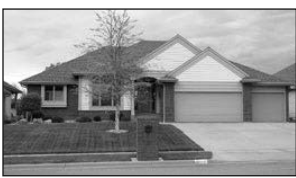
2707 Lakeview * $375,000

4-Bedroom, 2-full bath, 1881 square feet, 2+ car garage. (605)660-7537 www.yankton.net/app/html/204brown/