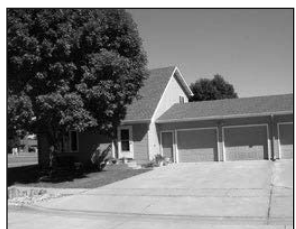
2006 Green * Private Listing

2+ bedroom on large corner lot. Near downtown, $22,777. Call Emma, Century 21 (605)661-2224.