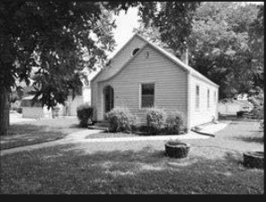
Great starter home or rental! 310 Locust $67,900

3-bedroom, 2-1/2 bath, home sits on a large lot, finished basement. 2-Fireplaces, newly remodeled bathrooms. David (605)664-8504. http://www.yankton.net/app/html/911w12th/