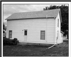
1610 Oak • Tyndall

1-1/2-story, 5-bedrooms, 3-1/2 baths, 3-car garage, corner lot in Summit Heights. Available October 1st. (605)661-1799 for viewing or more information http://www.yankton.net/app/html/1300w17th/