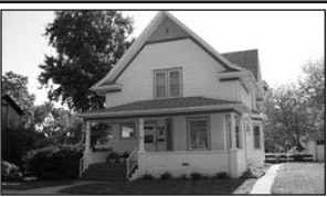
606 Capital • $131,900

Magnificent 5-bedroom 6-bath home with 4-fireplaces and gorgeous upscale kitchen! Ginny, Discovery Realty, LLC (605)661-6031.