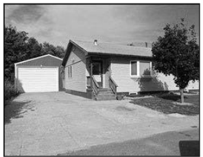
304 Wicker St. Gayville • $146,000