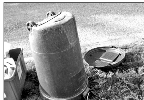
A photo of the garbage can and the lid after the trash has been collected.

Fernande Colette Bitsos, Yankton I had to write about it! I have read more than once the instructions given by the city garbage collecting service regarding putting lids on trash cans. However, the collecting service doesn't feel necessary to replace the trash containers with the "lids" back on them that can be easily secured by one or both handles.