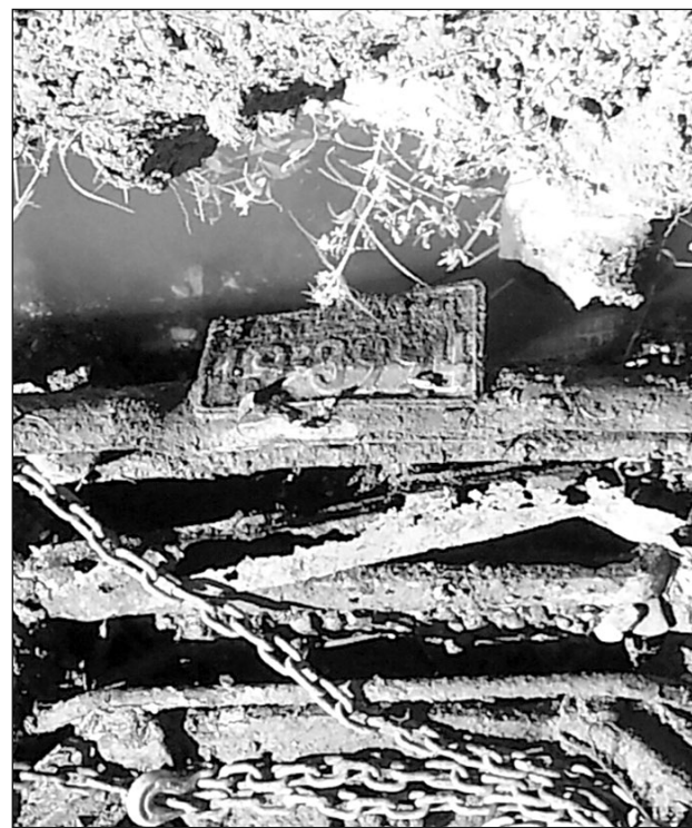
Crews lifted this 1960 Studebaker, believed to be the car driven by two 17-year-old girls who were last seen in 1971, from an embankment in Brule Creek near Elk Point on Tuesday afternoon.