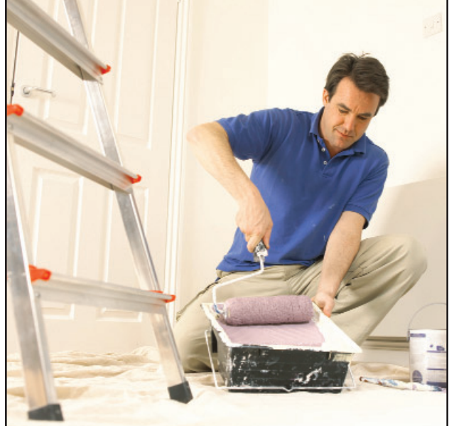
Fall is an ideal time of year to tackle home painting projects.

In addition, fixing up the roof in the fall ensures those winter storms, be it rain or snow, won't find their way into your home via leaks. A leaky roof in winter is hard to fix, as the roof surface could be treacherous in the winter and winter winds can make it dangerous to be up on the roof at all. Addressing leaks in the fall can prevent damage to your home's interior, which can mount up if a leaky roof is not addressed until the following spring.