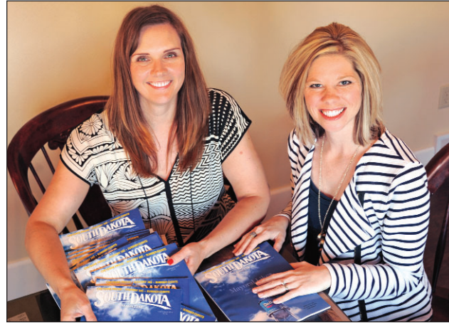
South Dakota Magazine Has New Publishers • 1B