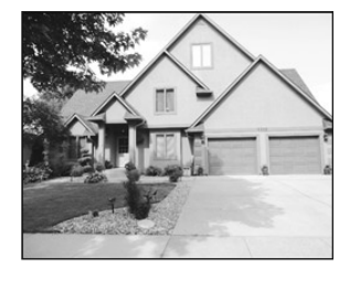
2308 Burleigh NEW PRICE REDUCTION: $319,900

2-bedroom starter home. Fenced vard. Carla, Century 21. (605)661-8643.