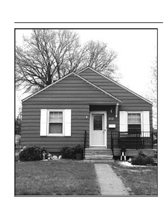
212 E. 15th · Yankton $83.900

Beautiful 2 story home 4-bedrooms, formal dining, large kitchen, main floor laundry and oversized garage. Call Brad Dykes (605)660-1414. Shore to Shore Realty, LLC.