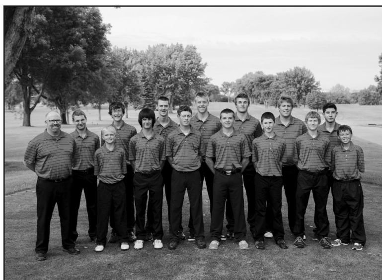
2014 YHS Varsity Boys Golf