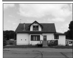
304 Main Street • Volin $90,000

6-bedroom, 2- full bath, 2-1/2 bath. Renting as a duplex Wayne, Century 21, (605)760-0780.