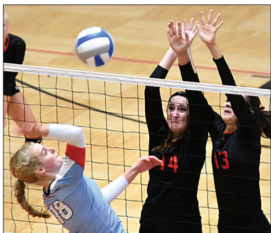
Gazelles Top SFL For First Win Of Season • 7