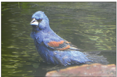
HAVE A PHOTO? Submit it to River City for publication in this space: RiverCity@yankton.net.