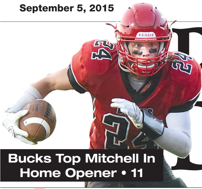
Bucks Top Mitchell In Home Opener • 11