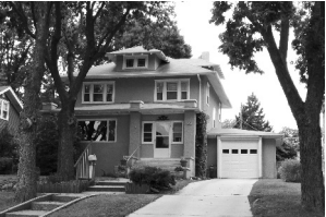
521 Maple St., Yankton $205,000

Lake area 3 bedroom, 2 bath with updated kitchen, fireplace, hot tub, large deck. Large wooded lot. Stan Sudbeck 402-841-5885. Lewis & Clark Realty, Inc.