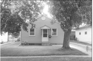
2024 Walnut St. $105,000

3-bedroom, 2-bath, den. Many updates, fenced yard. Century 21, 605-665-8970.