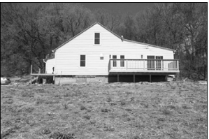
902 Beemer • $121,500

4-bedroom home with new kitchen and baths, new flooring throughout, finished basement, large corner lot. Just minutes outside of Yankton on paved road. 605-857-1472, 605-857-0903 http://www.yankton.net/app/html/55465hwy121/index.html