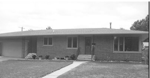
205 Golf Lane • $236,900 OPEN HOUSE

4 bedroom, 4 bath townhome. Open floor plan, 2 fireplaces, 3 season rooms. Fabulous water views. Stan Sudbeck 402-841-5885. Lewis & Clark Realty, Inc.