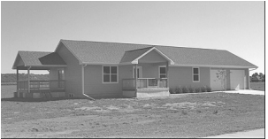
306 Lillie Lane $234,350

2-bedroom, 1-bath, 1-car garage home built in 1950. Partially finished basement. All appliances included. Many updates. 605-661-4323 for more information. http://www.yankton.net/app/html/2024walnut