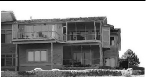
203 Calumet Drive $439,900

New lake area 3-bedroom, 2-bath with 1560 sq.ft on 1-acre. Vaulted ceilings, 2-covered decks. Lots of upgrades. Call Leslie Kuntz, Lewis & Clark Realty, Inc. 605-661-2647.