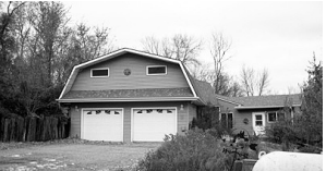
383 Lewis & Clark Trail $179,900