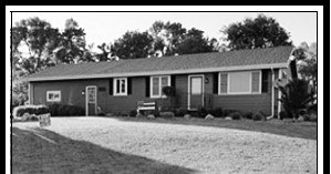
55465 Hwy 121 Crofton, NE

4-bedroom, 4-bath updated historical home. Carla, Century 21 605-661-8643.