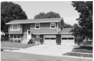
202 Northern $159,900

13 acre hobby farm in Vermillion. Large home with 6 bedrooms, 4 baths, built in 1912. Machine shed, corn cribs, garages, large barn and corral perfect for horses. 605-661-2509.