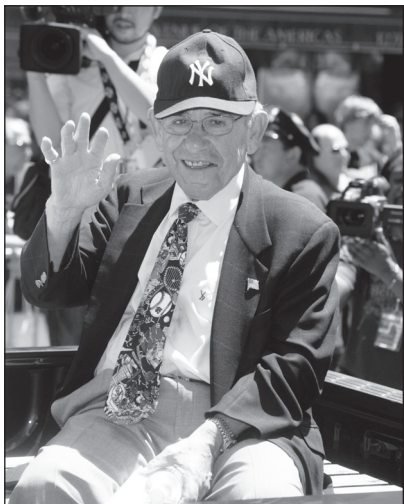
Yogi Berra, the Hall of Fame catcher and Major League Baseball coach renowned as much for his unique way of turning a phrase as his record 10 World Series championships with the New York Yankees, has died at age 90. He is seen here at the 2008 Major League Baseball All-Star Game red carpet parade in New York.

leaguer. “Some of us went to a movie with a yogi in it and afterwards Jack began calling me Yogi. It stuck,” Berra told the Saturday Evening Post. He was a fan favorite, especially with children, and the cartoon character Yogi Bear was named after him. Until recent years, he remained a fixture at Yankee Stadium and in the clubhouse, where the likes of Derek Jeter, Joe Torre and others in pinstripes looked up to the diminutive old-timer. In 1956, Berra caught the only perfect game in World Series history and after the last out leaped into pitcher Don Larsen’s arms. The famous moment is still often replayed on baseball broadcasts. After his playing days, Berra coached or managed the Yankees, New York Mets and Houston Astros. He led both the Yankees and Mets to pennants. In 1985, his firing as manager by the Yankees 16 games into the season sparked a feud with George Stein-