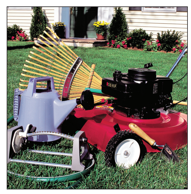
Shop now for end-of-season sales that help you complete home-improvement projects.

Fall can be an ideal time of year for homeowners to tackle home improvement projects, as the moderate temperatures make for ideal conditions to work in and around the house. In addition, many retailers offer consumer-friendly sales in autumn, helping homeowners to save money.